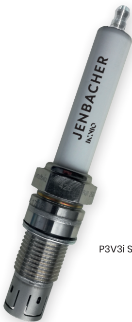
P3V3i Spark Plug

The P3V3i spark plug is applicable to all Jenbacher Type 2, 3 and 4 gas engine versions running on natural gas, biogas, landfill gas, sewage gas, or coal mine gas.